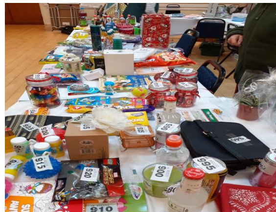
All these Tombola Prizes went