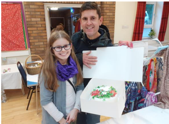
They guessed the cake weight